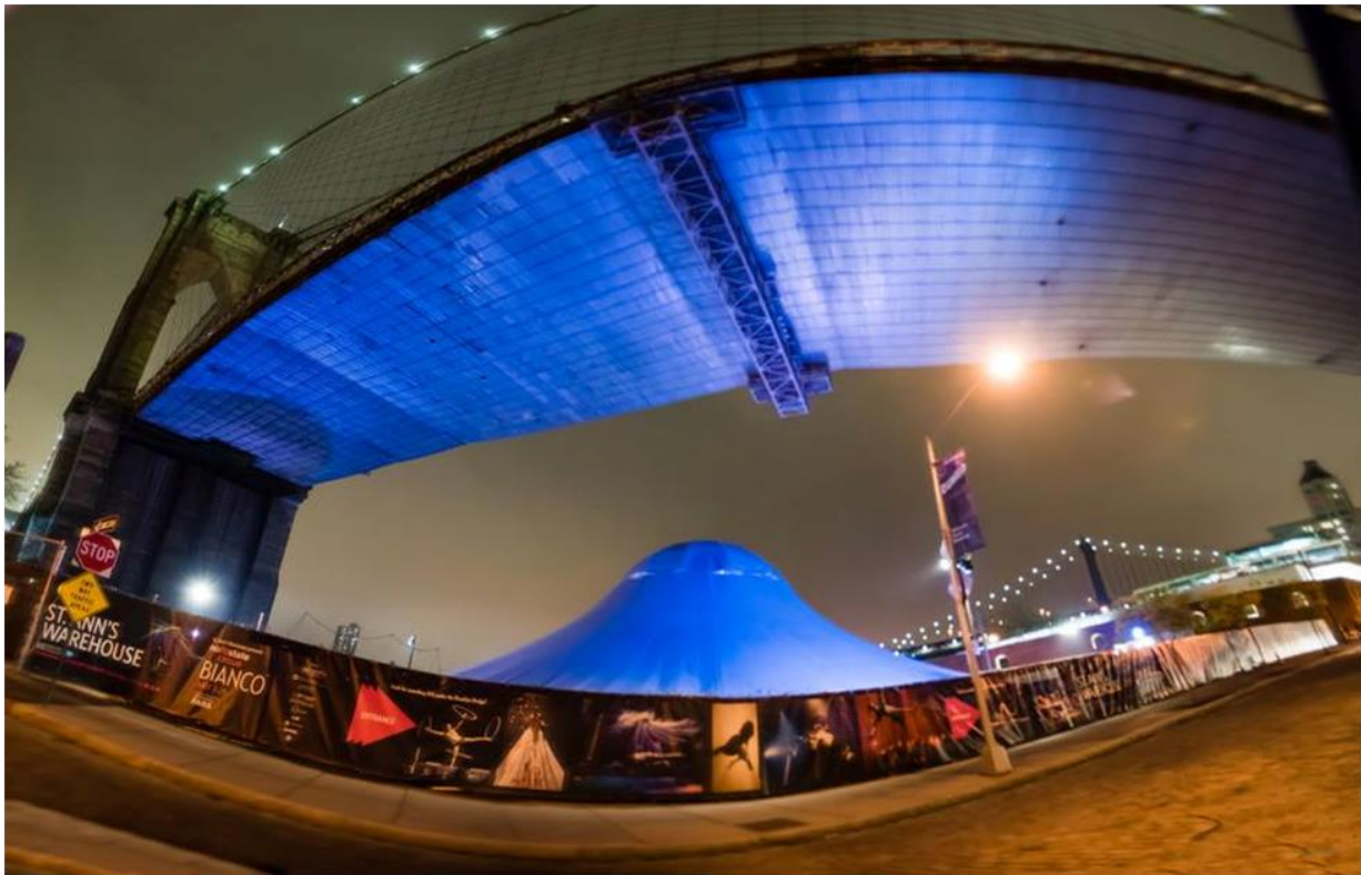
No Fit State's Big top under Brooklyn Bridge, New York. 2016